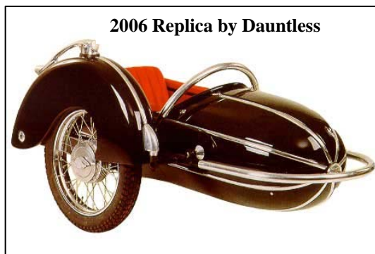
2006 Replica by Dauntless