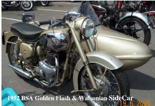
1952 BSA Golden Flash & Watsonian SideCar 19.6.2005

My first exposure to 'Outfits', as they used to be called back in England, was when I was about 10 years old. My next door neighbor had a new BSA Golden Flash hitched up to a Single Adult sidecar which