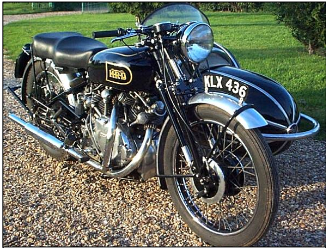
What the HRD Combination would have looked like. This is a 1949 'C' Series Rapide with a Steib S501 sidecar.

All the talking, all the reading and all the mental preparation I thought I had done could never have prepared me for what followed. Starting off entailed a lot more throttle to avoid stalling the engine and why the Hell is the machine turning left on its own? Compensating by counter-steering to the right was very tricky, but seemed to be a solution. I started out by driving around the oval periphery of the fence, leaning left with all the meager 130 pounds body weight at my disposal, to prevent the sidecar wheel from becoming airborne on the left hand turns. Then I discovered that hitting the brakes for turns caused an equal and opposite weight shift from the sidecar that caused the outfit to head for the fence. Slowing down on the engine brought about the worst case of 'tank-slapping' by the handlebars that I'd ever experienced at such a slow speed. It was time to crank down on the steering damper. It took every ounce of strength I had, just to turn the handlebars, leaning didn't work any more. I was beginning to learn why most sidecar racers are very highly muscled in the arms, shoulders and upper body regions.