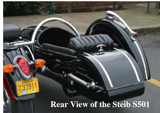
Rear View of the Steib S501

During the time the outfit was away I rode the HRD daily, often pondering the prospects of no more high speed bend-swinging or 'zigzagging' around the many 'S' bends that abound in the English countryside. I considered the prospects of down-gearing the outfit to cope with the weight burden of the sidecar, and of removing my prized 'Ace Bars' to get better leverage on the steering. I also tried to focus on the positive aspects of now being able to ride all year round, even on snow and ice due to the additional stability of three wheels on the road. My Insurance Company cut reduced my annual premium saying that an Outfit had the best safety record of all motorized vehicles. This proved to be the most subjective statement of all time. By the time I received the 'Its Ready' call from Dick Mares I considered myself to be completely mentally prepared.