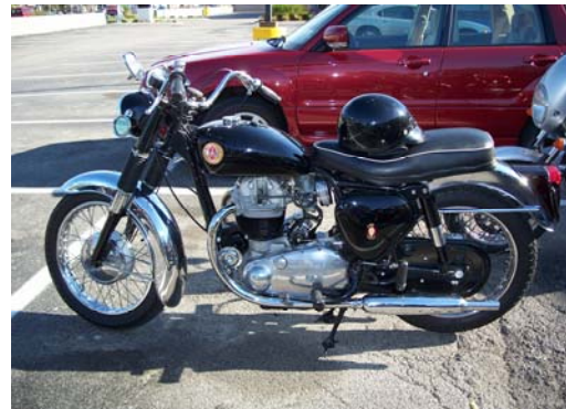
63’ BSA Super Rocket with 650cc Pre-unit A10 Engine – Mods choice for Best Rocker’s Bike

establishment on Woodward Ave., famed for its annual “Woodward Dream Cruise” classic ‘Muscle Car’ extravaganza. Around forty five machines arrived despite a chilly October morning. The rewards of the early cold ride in were a sunny and warm afternoon combined ride around local rural lake areas of Royal Oak. The ‘leaders of the pack’ were Buzz Jones for the Rockers and Darren for the Mods, who rode side by side to lead around forty-five riders on a fifty mile tour of local scenery. Many of the Mods were dressed in smart creased dress pants and dress shirts and neckties under their Parka jackets. Blue