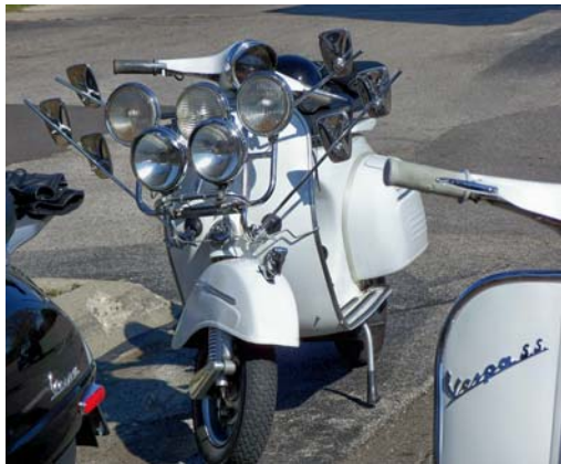
73’ Vespa Sprint with 200cc Engine – Rocker’s Choice for Best Scooter

Triumphs and Vespas alike descended upon the huge parking lot of a friendly and participating