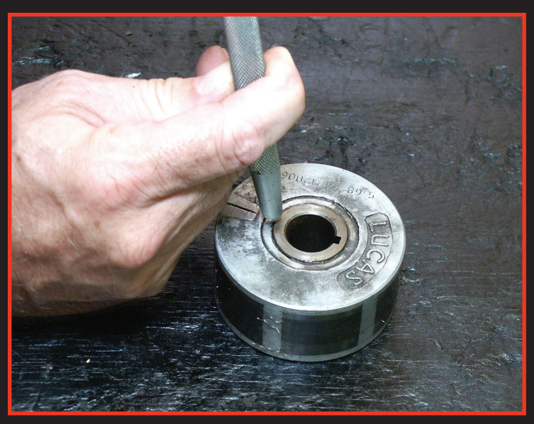
Punch-locking involves the use of a punch as shown. Work around the outside border of the insert, almost but not guite touching the insert. The indentations made by the punch often secure the insert.

motorcycles in Saskatoon, ing Canada in 1933. Over this time he