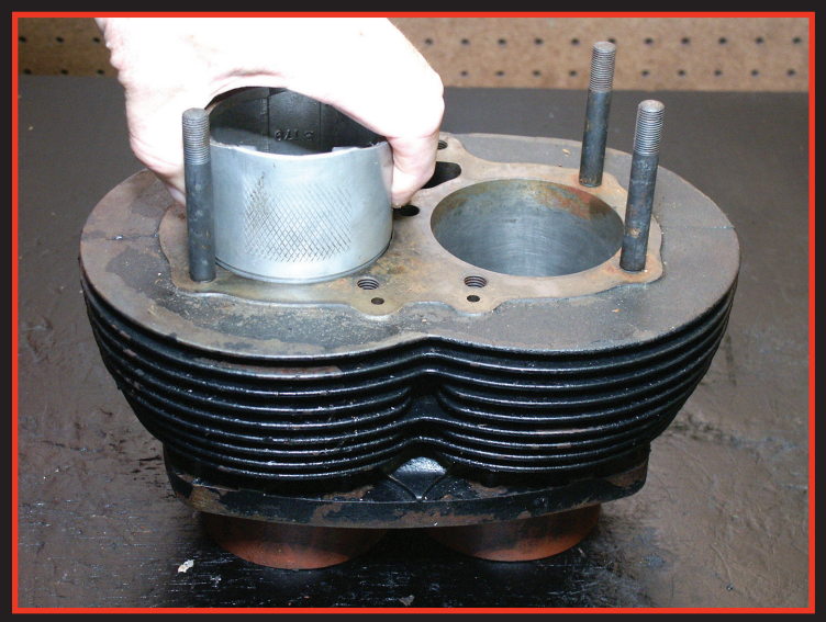
To measure bore wear, use the old piston and the top ring. Remove the ring and position it using the piston in the top of the cylinder, just slightly below the upper most point the ring travels under operation. This is where you'll usually find the most wear.

and if readers know of other sources, alone MMM is worth owning as a I'll gladly pass this information on. Quite frankly, anyone who likes to MMM is long out of print and turn wrenches on old motorcycles often goes for ridiculous prices on should try to get a copy while the last ones are still available. In the mean-