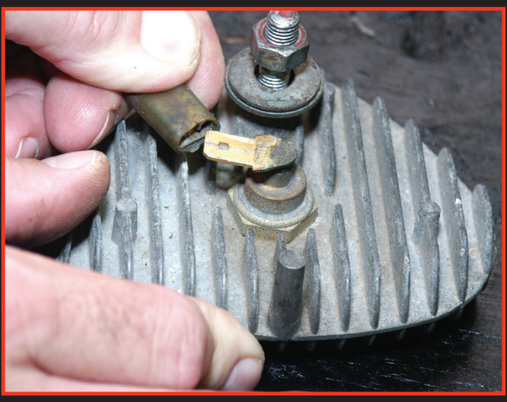
If you can get a spark to jump with the ignition on but the engine not running, the diode is leaking and must be replaced.