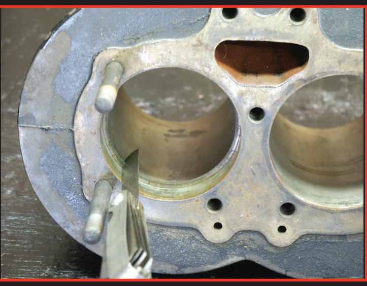
Measure the ring gap with a feeler gauge near the top of the cylinder and record measurement.

and remove the connector to the diode. If bringing the connector close to the diode causes a spark when the motor isn't running, the diode is leaking and must be replaced. Nicholson also recommends using Locktite on the diode threads because only 2 ft. lbs of torque should be used on the attaching nut. In absence of a tiny torque wrench, something Nicholson recognized as likely, he recommended using a very small wrench and only light pressure.