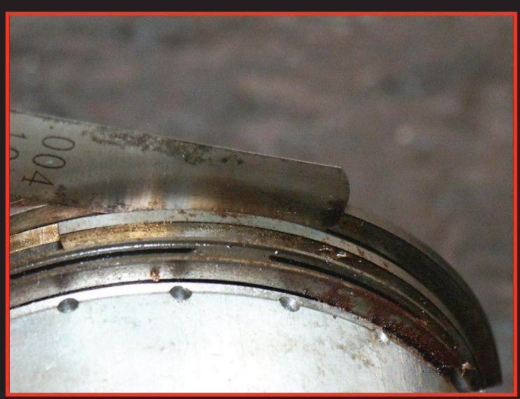
Check the clearance between the ring and piston groove with a feeler gauge as shown. If the clearance is .007 or more, the piston is shot and must be replaced. This one is at .004 and could be reused if otherwise undamaged.

rings and the remaining rings need not be disturbed."