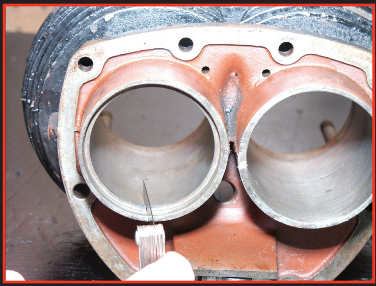
Second bore measurement is taken at the very bottom of the cylinder, where the piston rings never reach and consequently where the bore is unworn.